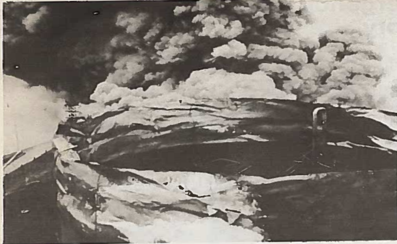
CARACAS, VENEZUELA — Smoke billows ominously out of oil tank on the coast near here. More than 200 were subsequently killed fighting the flames which burned without let-up for three days. A local REACT Team, "Cuerpo de Emergencia — Transmisiones" lost three of its members in fighting the blaze.