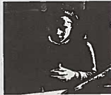
Impaired Driver Alert - CB Radio Channel 9

"Have you been drinking? Please don't drive...please?"