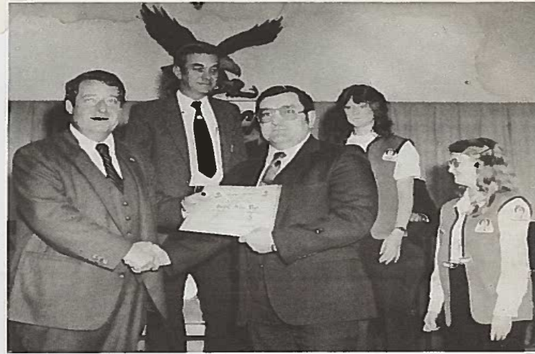
ST. LOUIS — Part of the action at second annual Law Enforcement Appreciation Night sponsored by Gateway Area REACT. Police officials from 89 municipalities, districts in the St. Louis area were honored at the event.