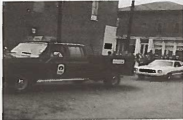
JACKSON, MI — Entry of Wolverine REACT in the annual Rose Parade of Jackson County, Michigan.

The list goes on and on for the rest of the year — adding up to a very productive and busy, as well as successful year for the Team.