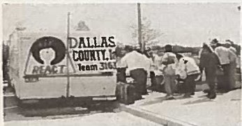
ADEL, IA — Part of the hundreds of travelers from all over the USA and Canada who were attracted to the Dallas County REACT Team 3163 Safety Break held on the Memorial Day weekend. The Break proved a refreshing breather to the monotony of traveling long distances.