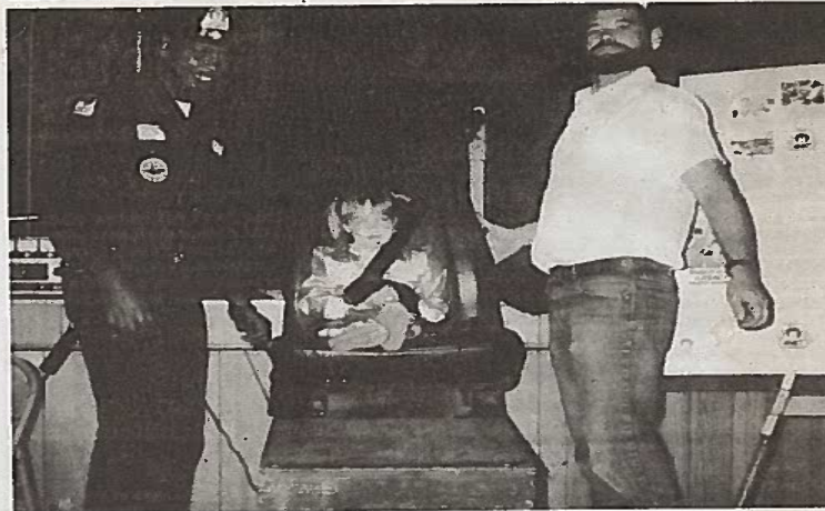
BOSSIER CITY, LA — Safety Seat demonstration presented by Twin Cities REACT at the Holiday Dixie at Barksdale Air Force Base proved popular attraction.

BOSSIER, LA — Holiday in Dixie, in the Shreveport Bossier City area, went out with a bang and a roar, Sunday, April 24, as the skies over Barksdale Air Force Base screamed with the blast and smoke of jet engines during the Festival's last event. Barksdale's Annual Open House officials estimated that there were a record-breaking 170,000 people craning their necks to see an air show that included take-offs and fly-bys from aircraft on hand to mark the Base's 50th Anniversary.