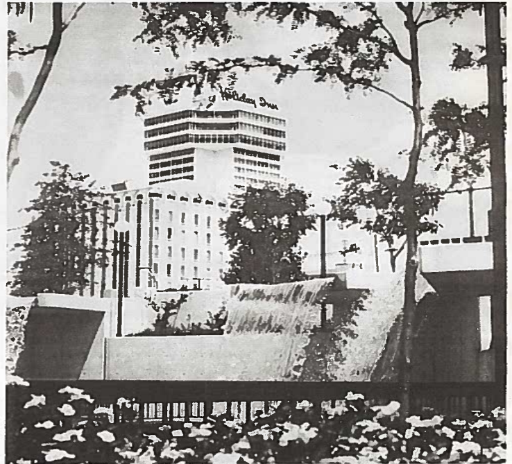
WICHITA, KN — Water cascading down the plaza is an attractive foreground for the Holiday Inn Plaza Hotel where REACTers from all corners of the United States will gather July 25-28 for the REACT International Convention.

(ENCLOSE $35 PER PERSON — EARLY REGISTRATION FEE. $50 AFTER MAY 31, 1983. INCLUDES BANQUET AND ALL CONVENTION MATERIALS.)