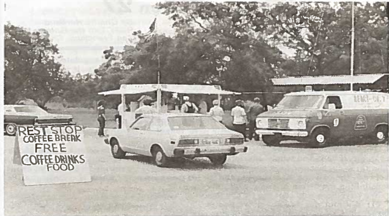
SAN ANGELO, TX — Part of San Angelo REACT's activities, but a very important part, was the Team Safety Break, held over the Memorial Day weekend. More than 220 manhours of work went into insuring the event's success. Some of those who stopped to rest their minds and their spirits are shown in the photo above.