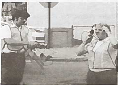
NASHUA, NH — Part of the contingent of 14 from Nashua REACT Team #3265 who were involved in Nashua's annual Block Party are seen getting set up. Six traffic locations were covered and members were ready to shut them down and to divert traffic per instructions of the Nashua Police Department at a moment's notice.