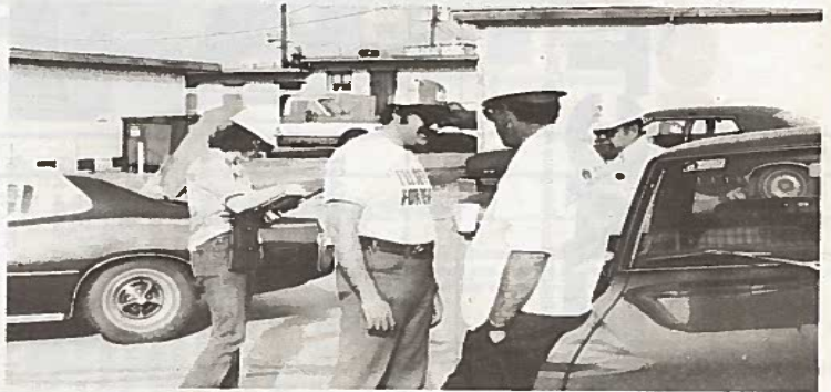
BARTLESVILLE, OK — Caney Valley REACTers get ready for action slightly before tornado swept down and caused an estimated $20 million in damages in Bartlesville.