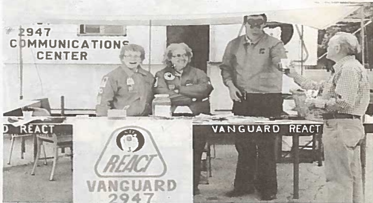
VILLA PARK, IL — It must be contagious. Doing good is often its own reward, as the smiles on the faces of these REACTers, members of Vanguard REACT, seem to confirm. The group is caught in action at Team sponsored Safety Break held over the Labor Day weekend with the help of Metro North REACT and Tri-State REACT.