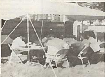
BOSWELL, IN — This is how Benton County REACT Team 4298 was set up for its Safety Break held over the July 4 weekend at the County Fairgrounds. The Team had a fine turnout of motorists and travelers, serving them food and soft drinks throughout the weekend.