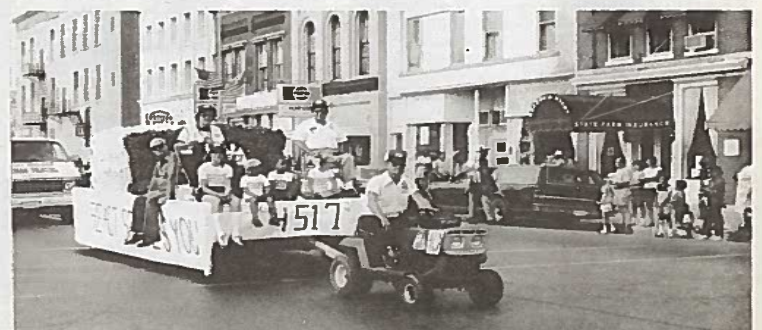
CONOVER, OH — World's largest REACT cap (we have it on good authority) is seen mounted on float which was entered in the local County Fair.

The inscription on the float was: "REACT SERVES YOU" and "JOIN 4517 AND WEAR OUR CAP."