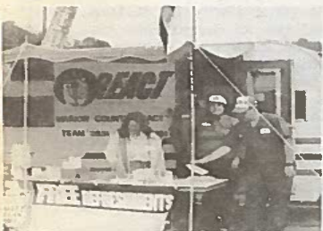
FAIRMONT, WV — Coffee provided graciously to passing motorists by Marion County REACT Team 2831 is gratefully accepted at Safety Break held over the Decoration Day Weekend.

FAIRMONT, WV — Not content with setting up a Safety Break over the major holidays, members of Marion County REACT Team 2831 provided tea, coffee, hot chocolate, donuts and cookies for 72 days at the site of an Environmental Pollution Unit cleanup. The Team put in more than 1,728 man-hours on this one project alone.