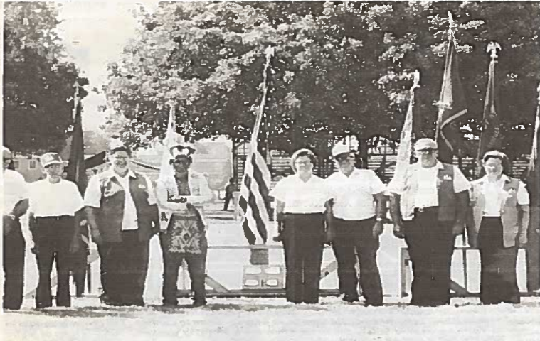
LEXINGTON, KY — REACT at the VA Hospital. Members, who are seen on the hospital grounds, help with the wheelchair patients and were at the hospital September 10.