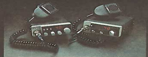
The new Uniden PC 33 and PC 55 super-compact models are full-featured, yet so small that they almost fit in the palm of your hand!

We're proud of what we make. So you'll be proud of the Uniden radio you use. Ask your dealer for the Uniden PC 77 CB radio built for professionals just like you. You'll be talkin' proud!