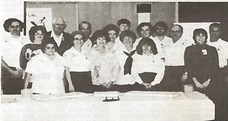
EVANSVILLE, IN — Members of Vanderburgh County REACT C296 at recent meeting where highway signs were presented. Signs are now located at several key locations in Vanderburgh County.

EVANSVILLE, IN — By special arrangement with a sign manufacturer in Indiana, Vanderburgh County REACT, Inc. is able to make available to other REACT Teams these high quality, regulation size highway signs at $30.00 F.O.B. destination in U.S. These 24"x30" signs say: