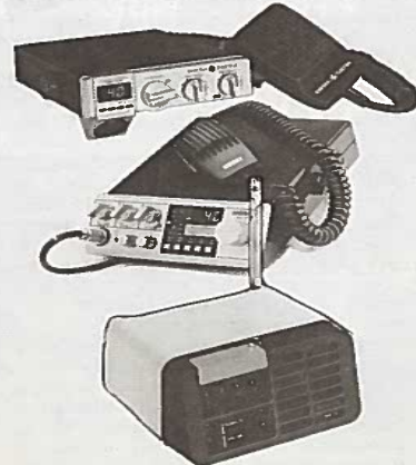
Here are some of the great "Early Bird" prizes REACT Teams will win!

Be sure that your Team sends its registration in prior to December 31st to participate in this fun and productive "Early Bird" registration drawing.