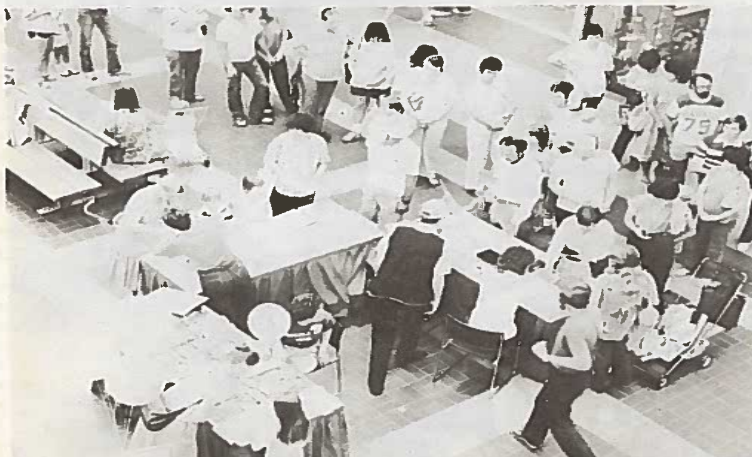
AUSTIN, TX — People lined up for hours to buy child safety seats at wholesale cost. The six-hour sale put almost 400 child safety seats in parents' cars. REACT's Travis County Team 3022 helped with the sale, sponsored by Greater Austin Child Passenger Safety Association. (For more details and another photo, see story on front cover.)

Price applies at participating Radio Shack stores and dealers.