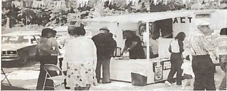
FARIBAULT, MN — This is the lively scene that greeted travelers when they stopped by at Safety Break sponsored by RCC REACT to get refreshments and stretch weary limbs.