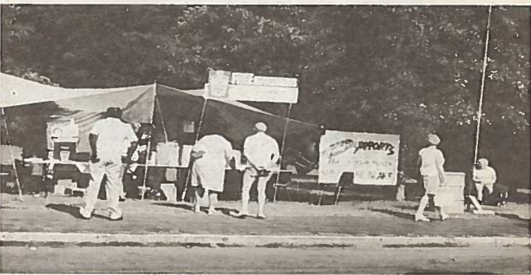
SCHENECTADY, NY — Team setup of the Schenectady County and Hudson Mohawk REACT Team's Safety Break held over the July 4 weekend proved attractive to more than 10,000 holiday travelers who stopped for a welcome called from their hometown.