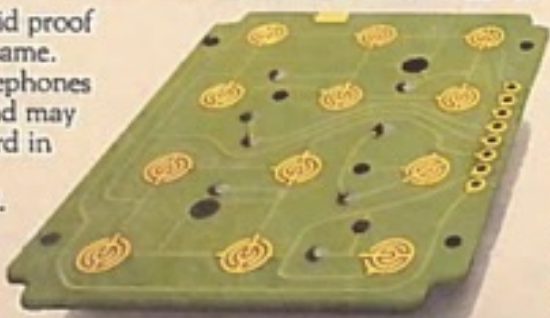
Long-life, non-corroding, gold-plated contacts.

We're so sure of our phones' reliability we back them with a two-year full warranty. No one else comes close. Our cordless phone, the Voyager, has a one-year full warranty.