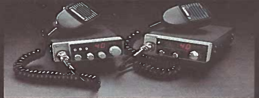
The new Uniden PC 33 and PC 55 super-compact models are full-featured, yet so small that they almost fit in the palm of your hand!

We're proud of what we make. So you'll be proud of the Uniden radio you use. Ask your dealer for the Uniden PC 77 CB radio . . . built for professionals just like you. You'll be talkin' proud!