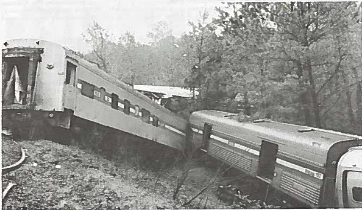
HENDERSON, NC — Cars dangled every which way in Amtrak train derailment in which Vance County REACT Team 3032 figured prominently.