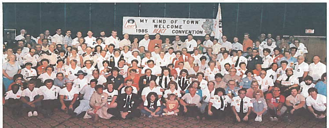
Thirty states, two Canadian provinces and Puerto Rico were represented by the nearly 200 attendees at the 1985 REACT International Convention. They enjoyed the hospitality of Chicago, and the efforts of the Illinois REACT Council to provide a stimulating, educational and enjoyable experience.

Plan to Attend REACT International Conventions: 1986—Calgary 1987—San Antonio