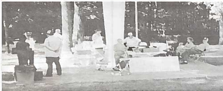
CROWLEY, LA — This Coffee Break setup of Arcadia REACT Team 4593, on eastbound Highway I-10, attracted 300 motorists passing through on July 6. Motorists from as far away as Hawaii, Canada, and Mexico stopped by for coffee, KoolAid, cookies, donuts and other refreshments.