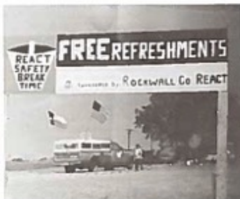
Rockwell County REACT #4683 set up for safety.

Since July 1 we have gained 19 new members. We're looking forward to building our Team with more new dedicated people.