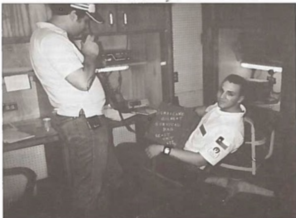
Guadalupe REACT members man the Hurricane Monitoring Station. One member takes time for his hurricane survival kit lunch.

The following information is provided on actions taken by Kingsville REACT. Assisted Kleberg County Sheriff Dept. in notification of evacuation of low lying and flood plains area of Loyola and Riviera Beaches of the country. Established the Emergency Management Central Ch 9 communications base