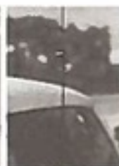
Model 904 Magnet Mount