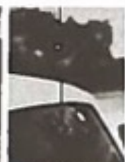
Model M-904 Magnet Mount