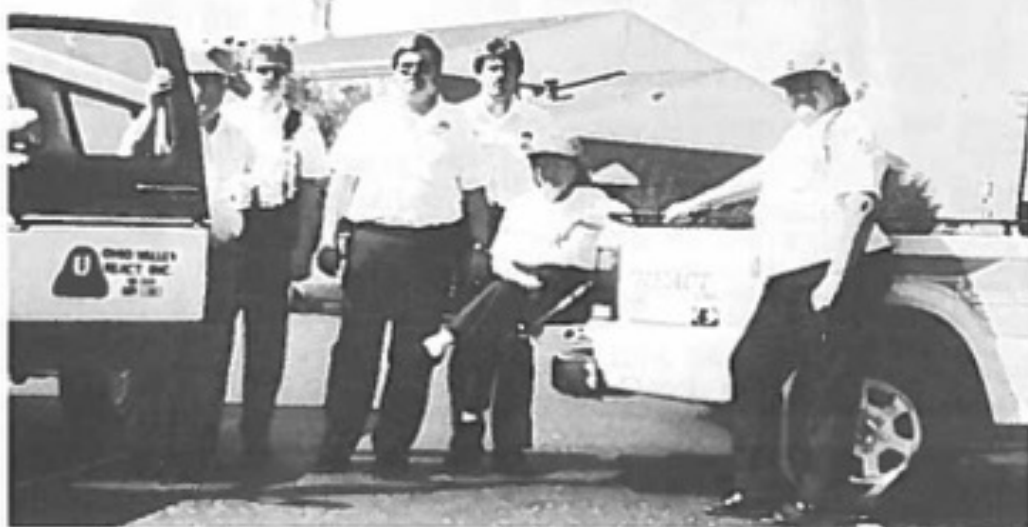
Members of the three REACT Teams assemble before the event.

#2601 Ohio Valley REACT, Cincinnati, Ohio , joined with Tri-County REACT #2624, West Chester, Ohio, and Northern Kentucky REACT #3221, Erlanger, Kentucky, at the Florence, Kentucky, U'All Parade. This is an annual "do" by Northern Kentucky and they have had the job for ten years (at least). It