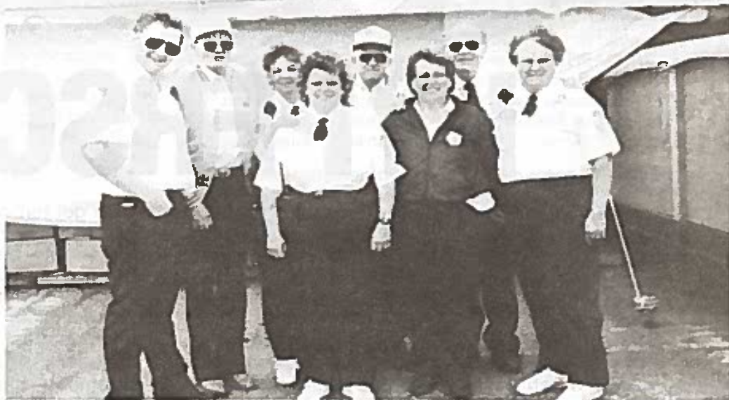
Whiteside County REACT #4714 helped work on the Newmanfest which was May 16 through May 20. The Newmanfest was started 19 years ago, to help support Newman Central Catholic High School. Activities held during the event included a Beer Garden, Carnival, Home Show, large food tent and dancing.

Whiteside County REACT is on their second year with the Newmanfest. They helped with ID's, exit gates and the Home Show. A total of 311 hours were donated during the fest.