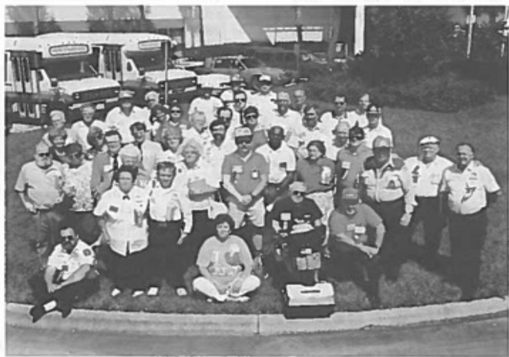
Life Members in attendance at the 1991 REACT International Convention held in Melbourne, Florida.