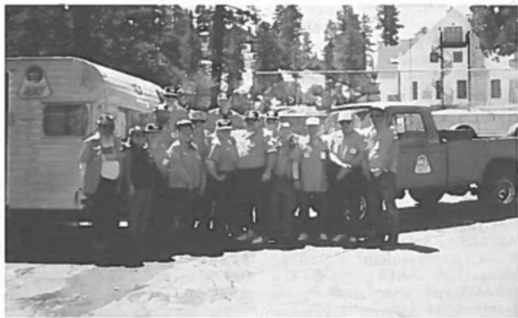
Big Bear Valley REACT Team #3111 plus three members of Lucerne Valley REACT Team #4758 after participating in the March of Dimes Walk-a-thon for the fifth year.

the next day. Because of the severity and amount of snow, the main access road in and out of the Big Bear Valley was closed for seven days.