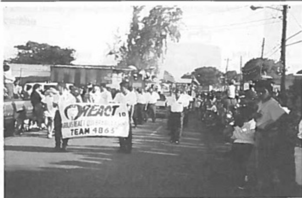
Aguilas REACT #4863, Teman, Puerto Rico participants in town activities. Pictured above is members of Team #4863 taking part in the town's parade. Pictured below is Team #4863 members providing communications and assistance during a recent carnival.

munications capabilities were activated. Years of planning by the local REACT Team and Red Cross Chapter really paid off on "Tax Day '94". Within two hours from the time the storm had hit, the key officers and personnel from REACT were in the Comm Center and reacting to the needs of our community.