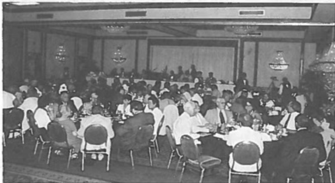
Board of Directors and attendees at the Meetings.