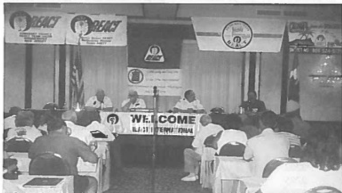
Members at the Banquet Courtesy Photo by Jim Koritzky Bangor, Maine