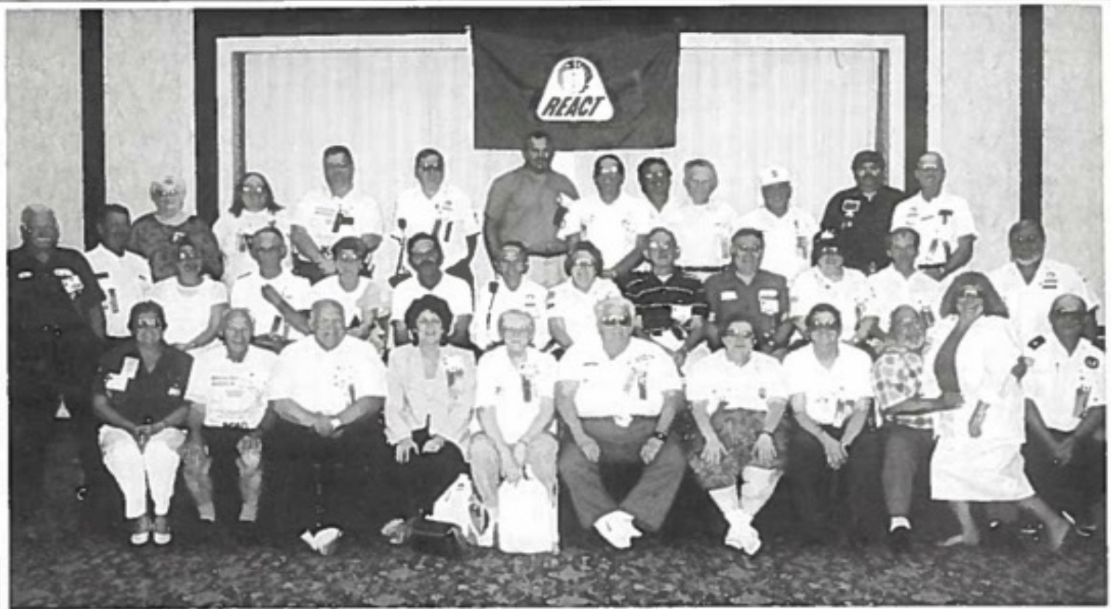
The photograph above is the Life Member attendees at the 1995 REACT International Convention hosted by the Nebraska State Council and Iowa State REACT Council. The photograph below is the Amateur Member attendees at the 1995 REACT International Convention which was held at Omaha, Nebraska.