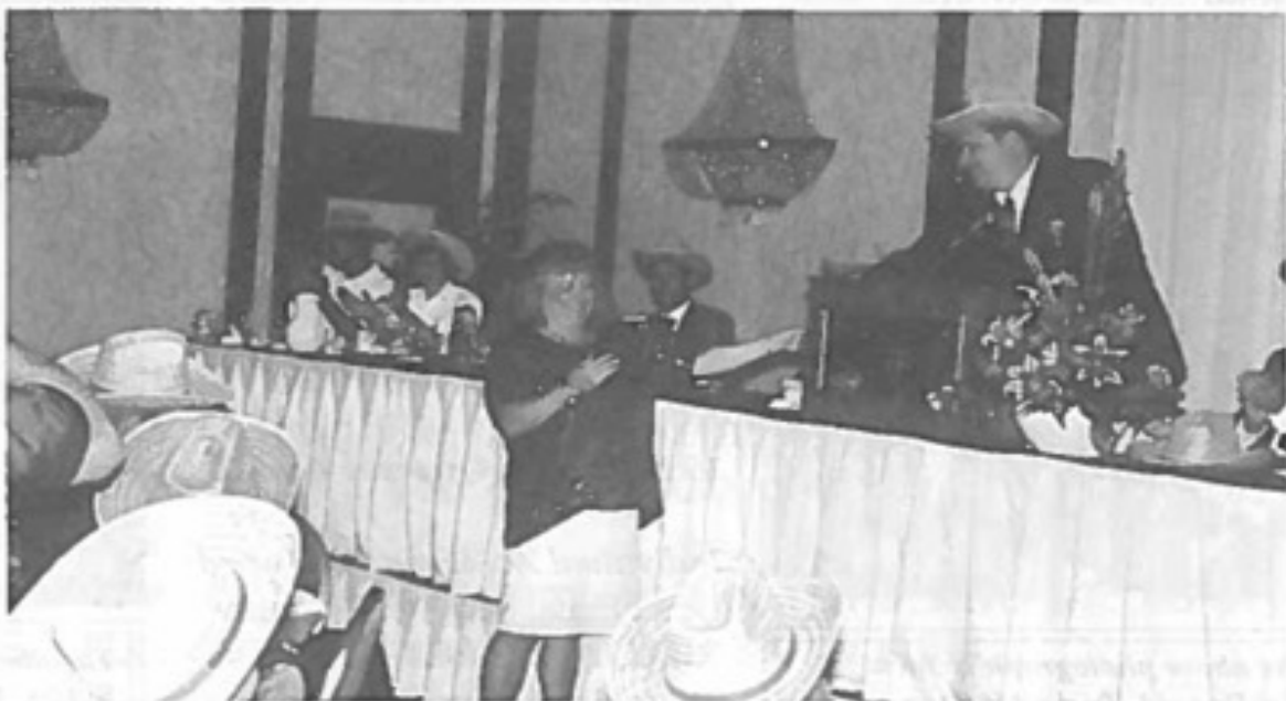
Attendees at the Meetings.