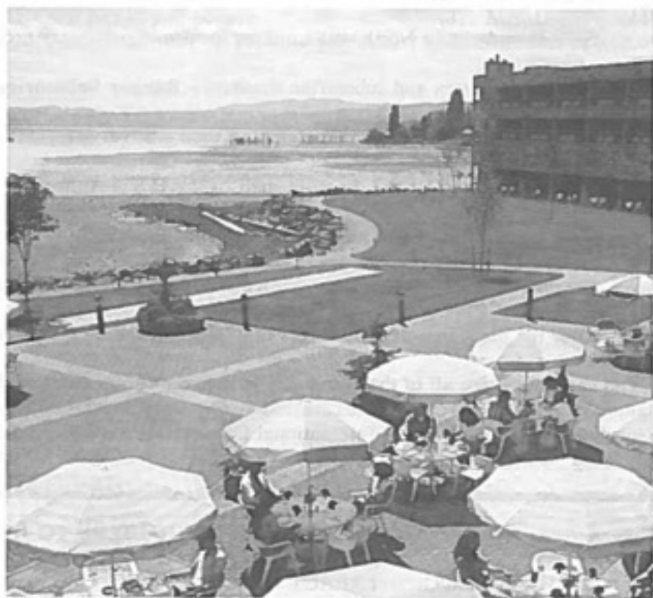
A panoramic view of Puget Sound as seen from the convention hotel - Silverdale on the Bay, Silverdale, Washington, the site of the 1996 REACT International Convention.

Size: 12 inch x 24 inch Material: White Posterboard Theme: REACT at Work