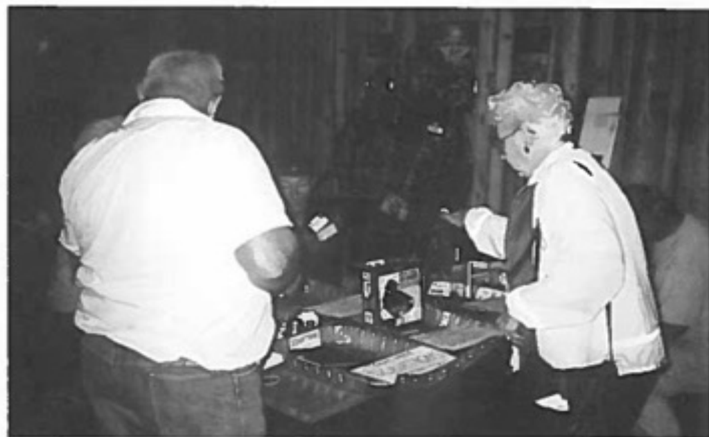
Fun was had at the recent Florida REACT Council Meeting. Attendees could use their draw tickets on prizes they liked. Here they place tickets in trays holding the prizes they hope to win.

Florida has faith in the future of REACT, too. It will bid for the International Convention in the year 2000. Good stuff!