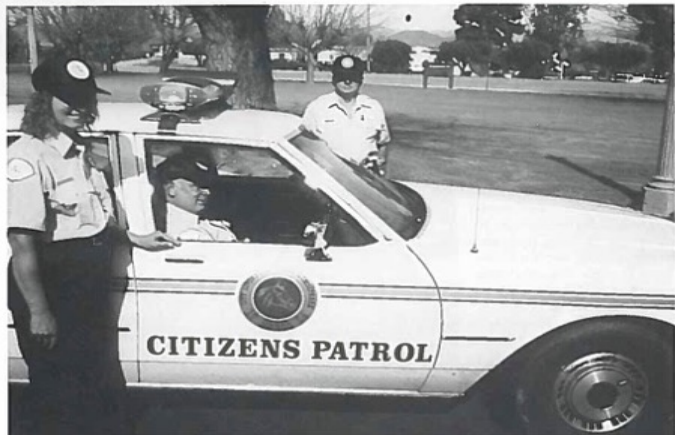
Members of Crest REACT #4252, California expands membership with Norco Citizens Patrol.

REACT International, Inc. P.O. Box 998 Wichita, KS 67201