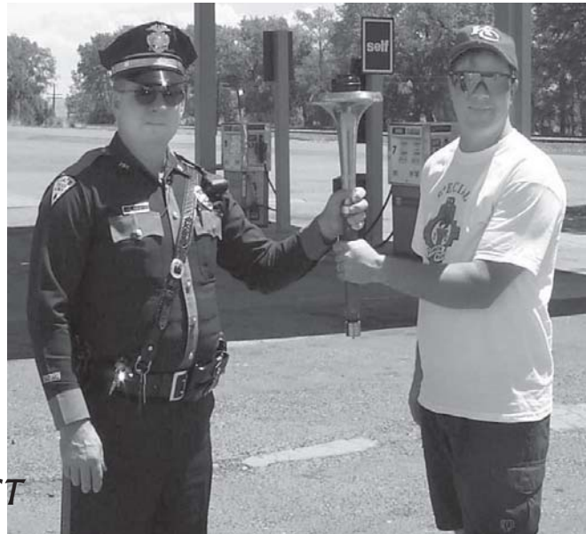
A New Mexico State Trooper hands off to a DEA Agent