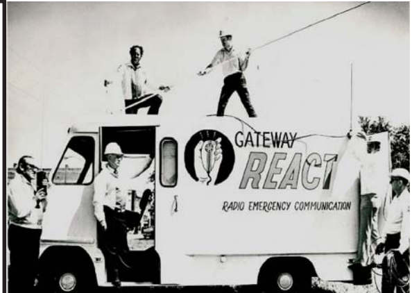
As REACT Teams' role expanded, so did their need for sophisticated communications equipment. Here, members of Gateway (Mo.) REACT are outfitting their "new" communications van. (From RI files, undated)

1970 – The FCC establishes official rules, reserving CB Channel 9 for "emergencies and assistance to travelers."