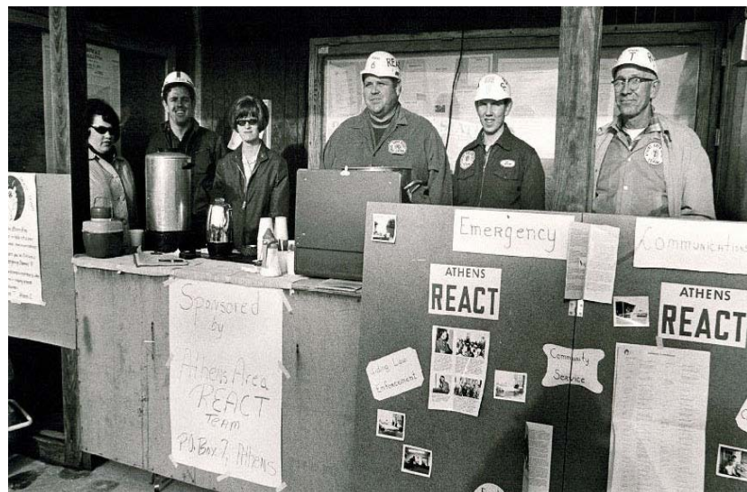
Members of the Athens Area (Ohio) REACT Team get ready for a Safety Break.

Membership reached as high as 400 during the "CB craze," and after years of slowly declining, Team membership stabilized at about 55 members in the early 1990s. In the past few years, membership has increased: the Team registered 66 members in 2002.