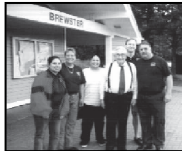
Dr. Henry Kissinger visits Dutchess/Putnam County (New York) REACT Safety Break