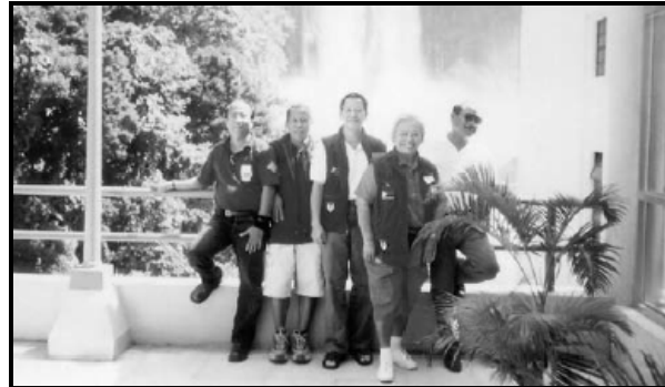
REACT Squid Team

There were new Teams to welcome, and existing Teams kept busy with wildfires, hurricanes, public service events, and man-made disasters. Let’s take a journey in photos through REACT ’s 2005.