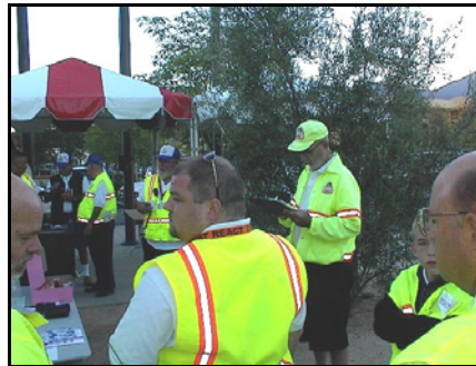
CREST REACT IN ACTION

Please bear with me as I learn this new task. But do send me your suggestions as well as your stories. Email to editor@reactintl.org .