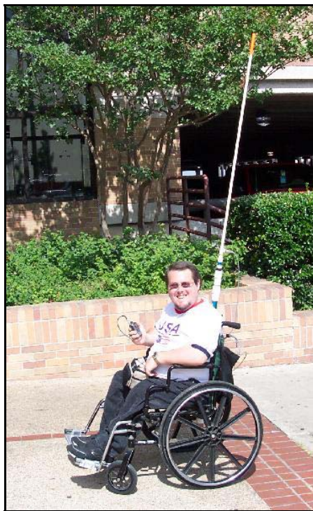
Telescoping mast assembly in use

watching our activities. When we were finished, Schuylar rolled back inside the hospital happily chatting away on his HT.