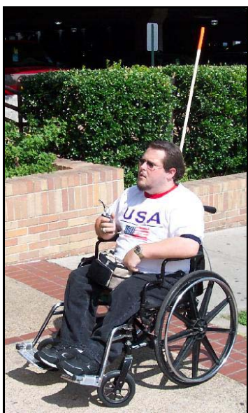
Indoor setting in use

The mast can be placed in a telescoping mast assembly, which allows it to be extended up to 14 feet; so if Schuylar is deployed outdoors or in a shelter with a high ceiling he'll be able to get out much better than with his HT's whip antenna. The photo above shows it at about 7 feet.