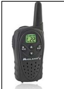
1-2-3 p. 3