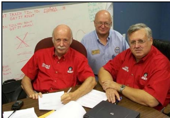
MARS MOU p. 5