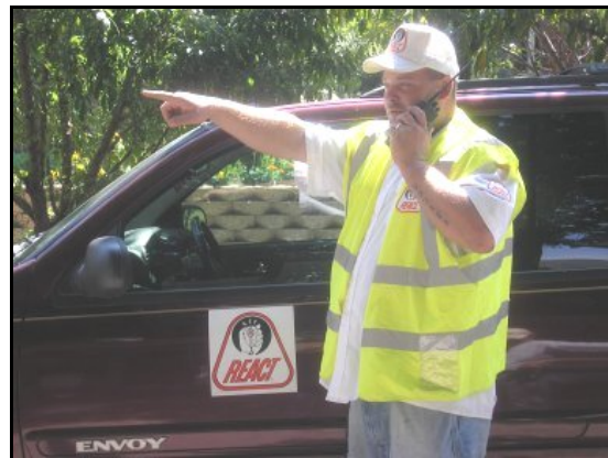
Teams and Team Members p. 10

From the President – 2 Teams and Team Members – 10 Board Minutes – 15