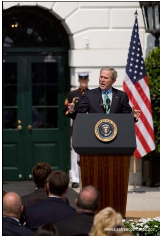
photo below (photo courtesy of USA Freedom Corps photo by M. T. Harmon).

Yes, I did, and it was terrific. Our assigned seat was near the center front (third row from the front, fourth seat from the center aisle). You can see the back of my head in some of the media photographs. See me in the bottom left corner of the