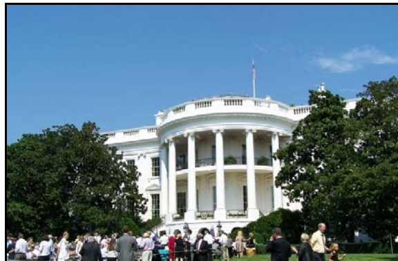
White House visit p. 4