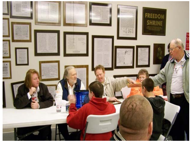
Flag City, Ohio Team members at Allen County meeting