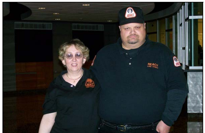
Lake City REACT Team members