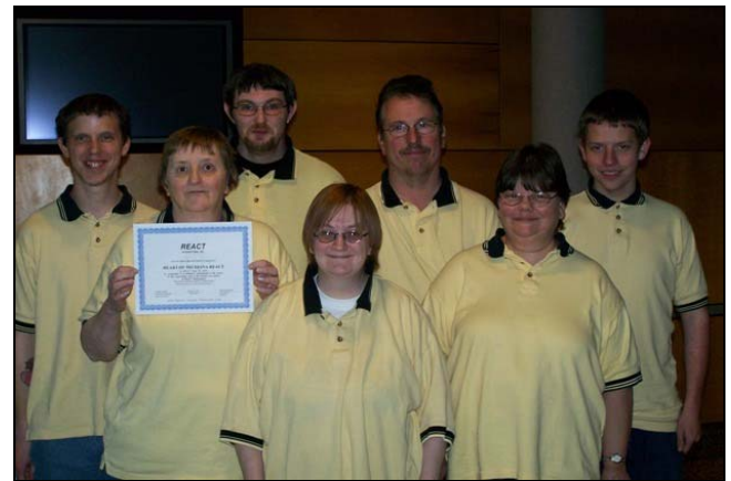
Heart of Michiana, Indiana REACT