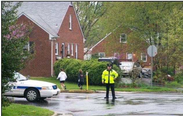
Prince William REACT, Virginia, Team C-109 member performing crossing guard duties at March of Dimes walk-a-thon Sunday, April 20.