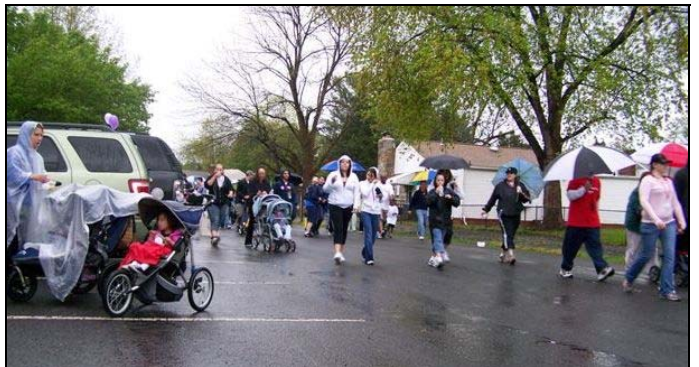
REACT was there; the public was there; but the weather was awful. The course was shortened due to the weather.