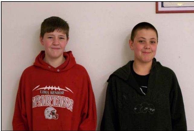
Allen County junior members