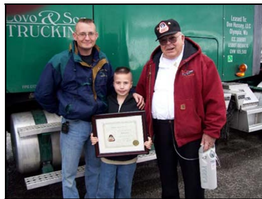
REACT International Hero Award – p 4

The REACTer (ISSN 1055-9167) is the official publication of REACT International, Inc., a nonprofit public service corporation. © 2005 RI. All rights reserved. Mailed at Periodicals Rate at Suitland, MD, and other mailing offices. POSTMASTER: Send address changes to REACT, 5210 Auth Rd., Suite 403, Suitland, MD 20746-4393. The REACTer is published bimonthly (six issues per year). The subscription price is included in members' dues. Subscription rate for nonmembers is $7.50 per year (U.S.). REACT Teams or Councils may reproduce articles in their publications if proper credit is given. Articles and photo submissions are welcome, but cannot be returned unless accompanied by a self-addressed envelope with sufficient postage. We are not responsible for unsolicited materials. Please see our Publication Guidelines at www.REACTintl.org for more information. For information regarding advertising, please contact the Advertising Manager at the e-mail address or the Suitland office address shown at left. The REACTer is available on-line, in full color, at www.REACTintl.org .