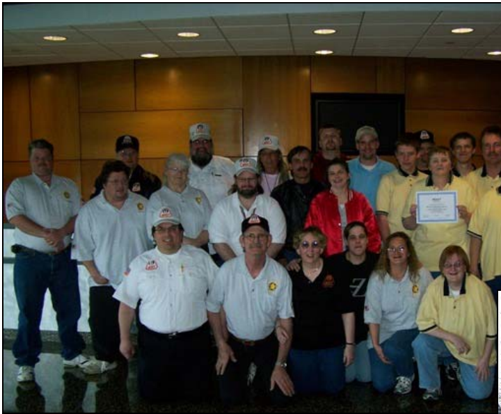
Members of the Indiana State REACT Council