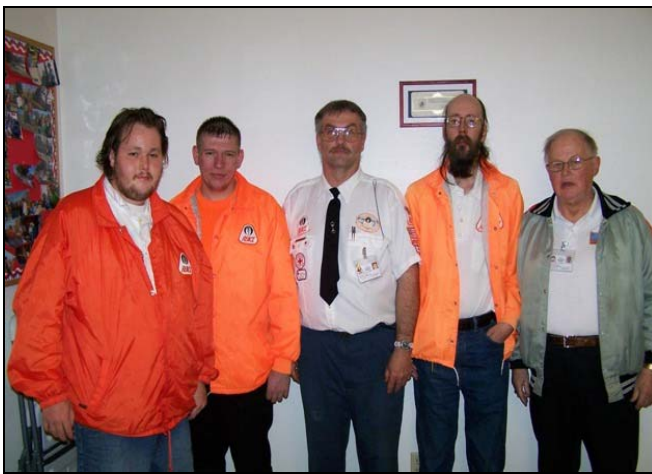
Allen County REACT officers