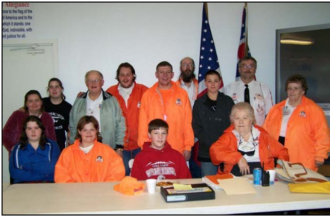
Allen County REACT , Ohio, Team C-322