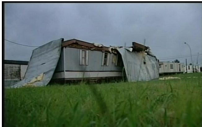
Weather: Teams and Team Members – P 15

The REACTer (ISSN 1055-9167) is the official publication of REACT International, Inc., a nonprofit public service corporation. © 2005 RI. All rights reserved. Mailed at Periodicals Rate at Suitland, MD, and other mailing offices. POSTMASTER: Send address changes to REACT, 5210 Auth Rd., Suite 403, Suitland, MD 20746-4393. The REACTer is published bimonthly (six issues per year). The subscription price is included in members' dues. Subscription rate for nonmembers is $7.50 per year (U.S.). REACT Teams or Councils may reproduce articles in their publications if proper credit is given. Articles and photo submissions are welcome, but cannot be returned unless accompanied by a self-addressed envelope with sufficient postage. We are not responsible for unsolicited materials. Please see our Publication Guidelines at www.REACTintl.org for more information. For information regarding advertising, please contact the Advertising Manager at the e-mail address or the Suitland office address shown at left. The REACTer is available on-line, in full color, at www.REACTintl.org .