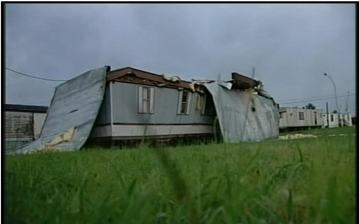
The Weather Strikes – P 5

Teams and Team Members –5 Silent Mics – 14