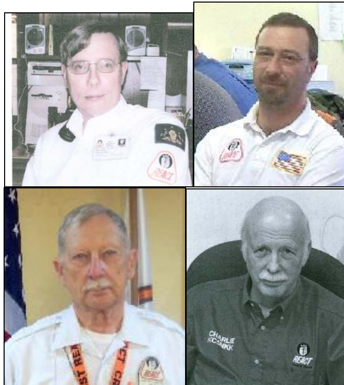
Election Time – 2

Election Time – 2 Board Minutes – 7 Teams and Team Members – 15