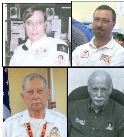
Election Time – 2

The REACTer (ISSN 1055-9167) is the official publication of REACT International, Inc., a nonprofit public service corporation. © 2005 RI. All rights reserved. Mailed at Periodicals Rate at Suitland, MD, and other mailing offices. POSTMASTER: Send address changes to REACT, 5210 Auth Rd., Suite 403, Suitland, MD 20746-4393. The REACTer is published bimonthly (six issues per year). The subscription price is included in members' dues. Subscription rate for nonmembers is $7.50 per year (U.S.). REACT Teams or Councils may reproduce articles in their publications if proper credit is given. Articles and photo submissions are welcome, but cannot be returned unless accompanied by a self-addressed envelope with sufficient postage. We are not responsible for unsolicited materials. Please see our Publication Guidelines at www.REACTintl.org for more information. For information regarding advertising, please contact the Advertising Manager at the e-mail address or the Suitland office address shown at left. The REACTer is available on-line, in full color, at www.REACTintl.org .