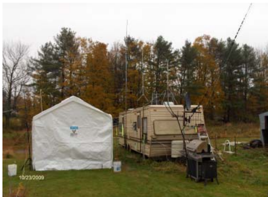
REACT of South Central Maine (6139) SET Exercise Report - 7