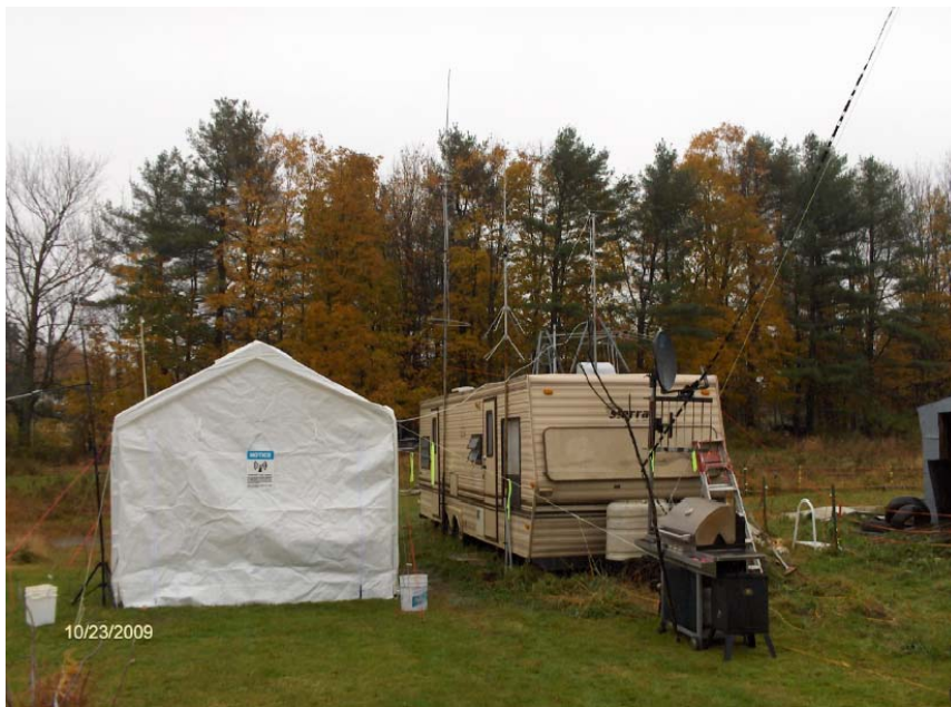
REACT of South Central Maine (6139) SET Exercise Report - 7

The REACTer (ISSN 1055-9167) is the official publication of REACT International, Inc., a non-profit public service corporation. © 2010 REACT International, Inc.—All Rights Reserved.