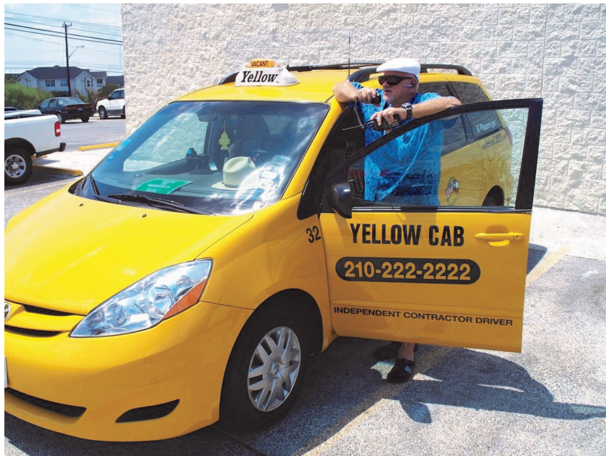
Hill County REACT Ham now a Taxi Driver - 12

Official Publication of REACT International, Inc Serving The Public Since 1962