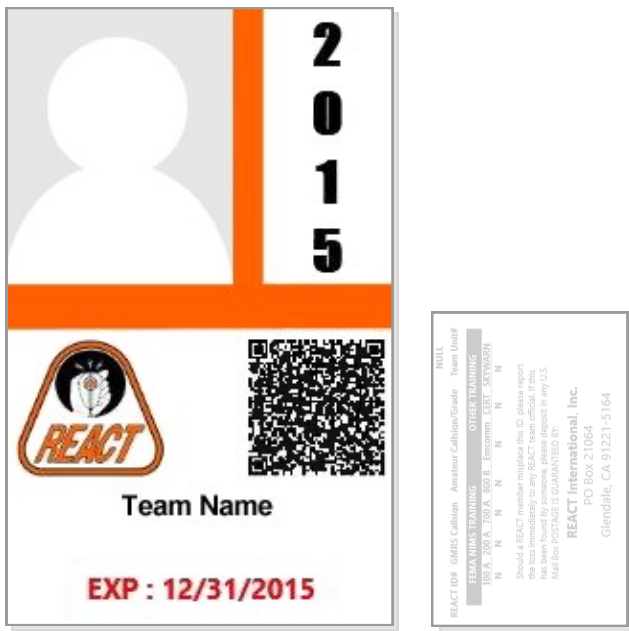
▲ Final design may vary

will be punched to allow use of a clip or to be hung from a lanyard. New cards will be reissued each year to renewing members.