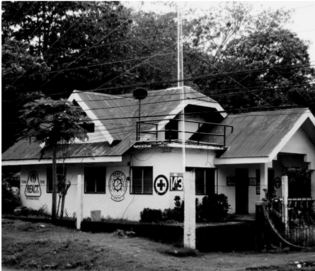
Team 6118, REACT Negor's Headquarters