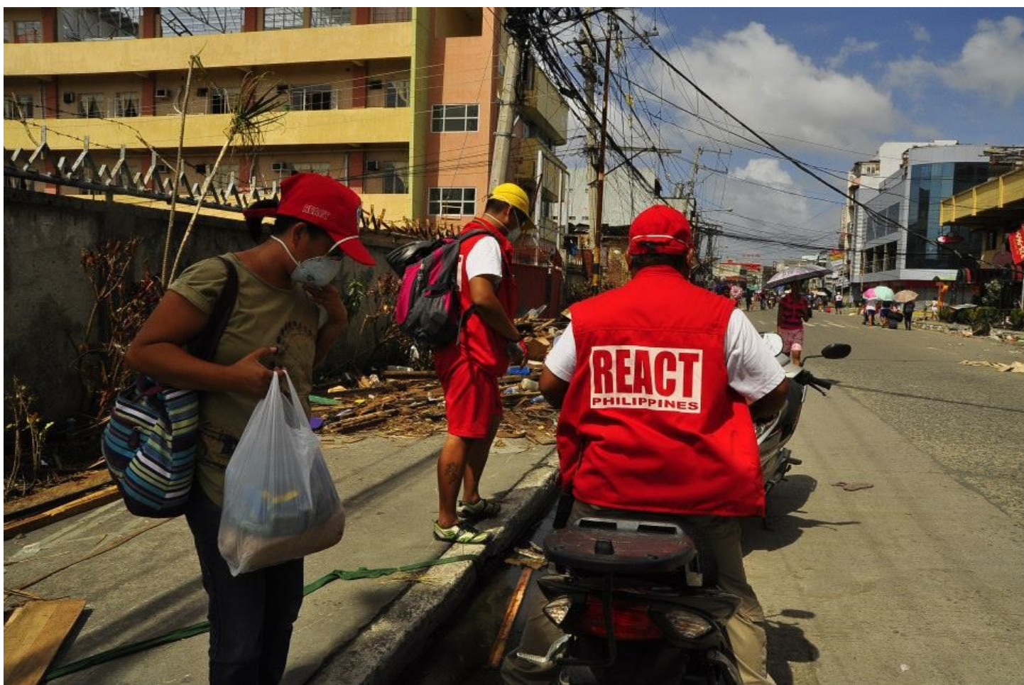
“Having experienced Typhoon Haiyan/Yolanda (in the Philippines) in 2013, REACT undoubtedly plays a critical role in emergency management and disaster response in the region.” (For full story, see R:9 update on pg. 10.)