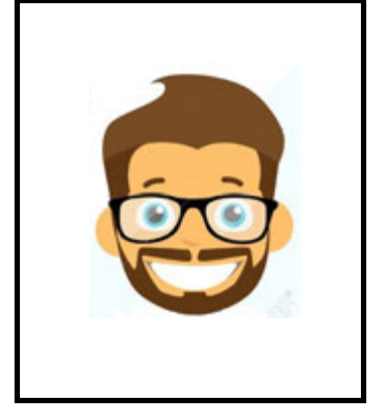
REGION THREE Vacant