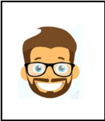
REGION FOUR Vacant