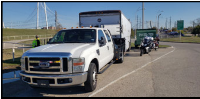
Dallas County REACT Command trailer

Dallas County REACT assembled on Saturday afternoon 11/9 and provided multiple team members for operator shadows of important event staff, and some stationed along the course at aid stations.