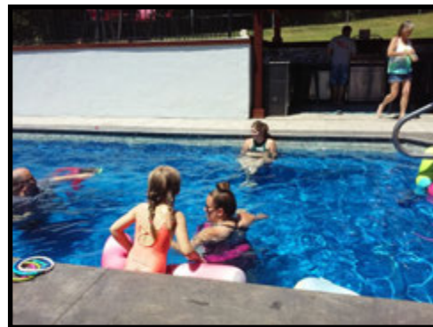
Team and family members enjoying a nice day at the pool.