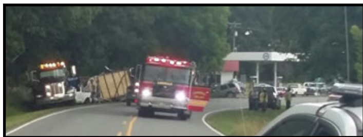
Cleveland County REACT members responded to a call to assist at a scene where a horse trailer was overturned in a crash with an SUV.

On June 5th, I was on my way to Shelby when I came up on an accident. Using my REACT radio, I got on the Cleveland County communications channel and told them what I had. They told me units had been dispatched. I stayed to help out the responding fire department from Lawndale. I provided assistance with traffic. The accident was on Highway 226.