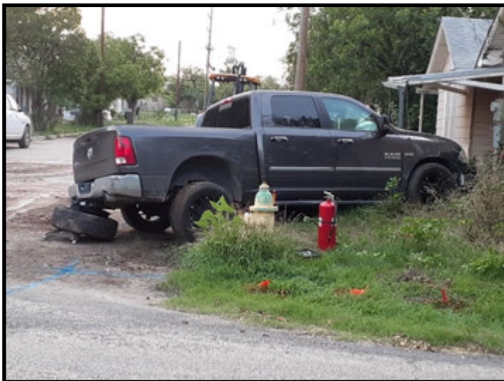
Scene in San Angelo, TX where a pickup missed a turn and crashed into a house and power pole.

We started at 3 am CDT. There were four of us, two elected officers and two team members. A Dodge pickup had failed to turn at a T intersection and hit a house. The area was evacuated since a natural gas line was cut. Four police units were working the crash which is most of the morning shift.