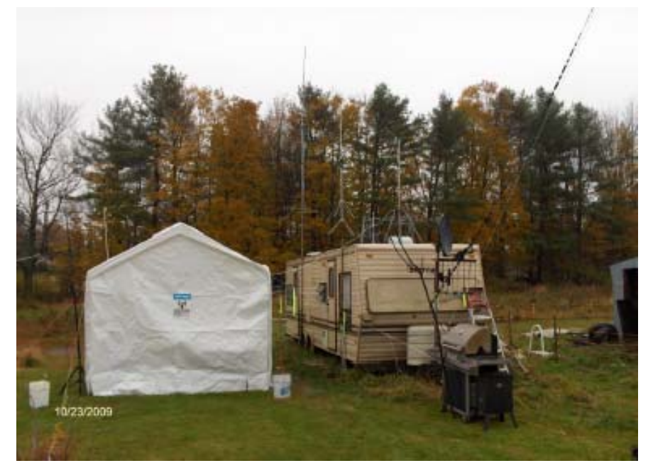
REACT of South Central Maine (6139) SET Exercise Report - 7