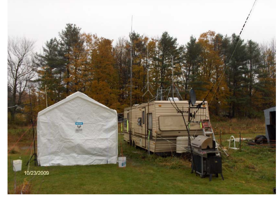
REACT of South Central Maine (6139) SET Exercise Report - 7

The REACTer (ISSN 1055-9167) is the official publication of REACT International, Inc., a non-profit public service corporation. © 2010 REACT International, Inc.–All Rights Reserved.