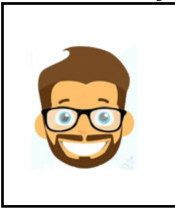
REGION FOUR Vacant