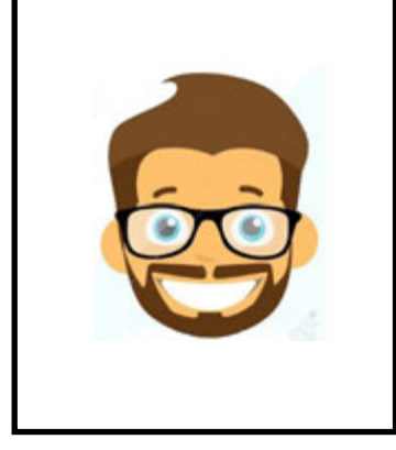
REGION THREE Vacant