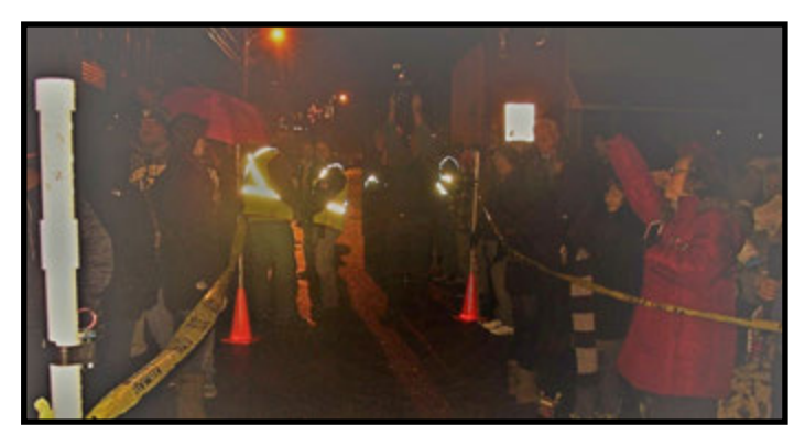
The REACT er