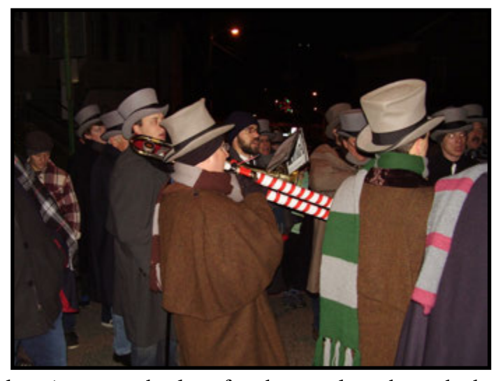
keeping a path clear for the carolers through the crowd, which usually numbers in the thousands.

We provide radio and crowd control for the event,