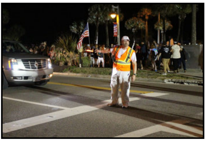
Team member directing traffic at the 4th of July event

Behind the scenes FCA REACT sets up a coordination post known as Post 1 over the radio using GMRS and social media communications. Members were present from 7 am through 11 pm working the event which concludes with a fireworks display. Following the fireworks REACT members assist with traffic control through the evening as the crowds head out of town.