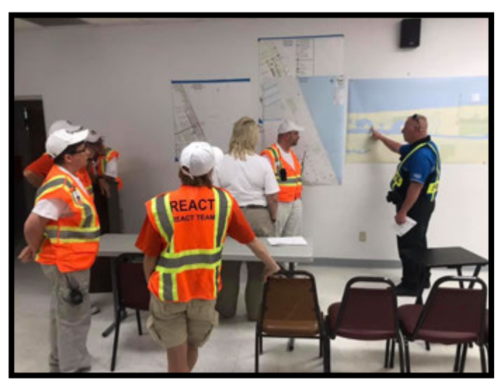
Team members getting briefing for the 4th of July event

On June 27th the Team was honored to be assist with the opening of the Historic Hewitt Mill. The Team assisted with traffic control for the event.