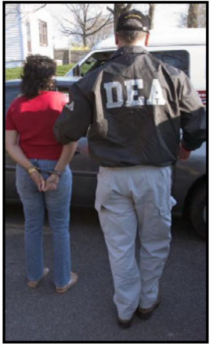
vate security forces A Drug Enforcement Administration agent to airplanes, boats use radios in the 406-420 MHz federal and and trains to just military band.

bought your first scanner because wanted vou to know what was going on in your community, your city or your neighborhood – espewhen you cially heard sirens or saw flashing lights flying past your home. Many scanner lisaccelerate teners the casual past public safety monitoring and discover their scanner is capable of hearing so many things – from tow trucks to priand trains to just about any imaginable radio user.