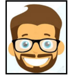
REGION 4 Currently Vacant