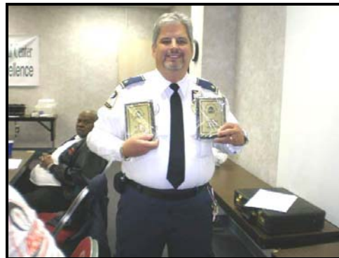
Points of Light – p. 6

The REACTer (ISSN 1055-9167) is the official publication of REACT International, Inc., a nonprofit public service corporation. © 2005 RI. All rights reserved. Mailed at Periodicals Rate at Suitland, MD, and other mailing offices. POSTMASTER: Send address changes to REACT, 5210 Auth Rd., Suite 403, Suitland, MD 20746-4393. The REACTer is published bimonthly (six issues per year). The subscription price is included in members’ dues. Subscription rate for nonmembers is $7.50 per year (U.S.). REACT Teams or Councils may reproduce articles in their publications if proper credit is given. Articles and photo submissions are welcome, but cannot be returned unless accompanied by a self-addressed envelope with sufficient postage. We are not responsible for unsolicited materials. Please see our Publication Guidelines at www.REACTintl.org for more information. For information regarding advertising, please contact the Advertising Manager at the e-mail address or the Suitland office address shown at left. The REACTer is available on-line, in full color, at www.REACTintl.org .